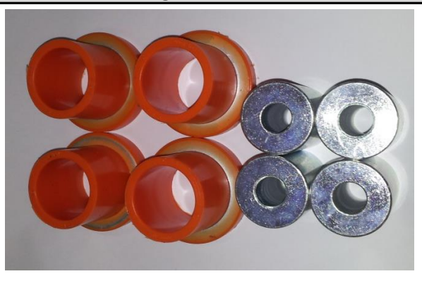
4x 1BJ Polyurethane Pieces and 4x 1BJ Tubes

The bush should be fitted on the wishbone such as the flange faces the front of the car.